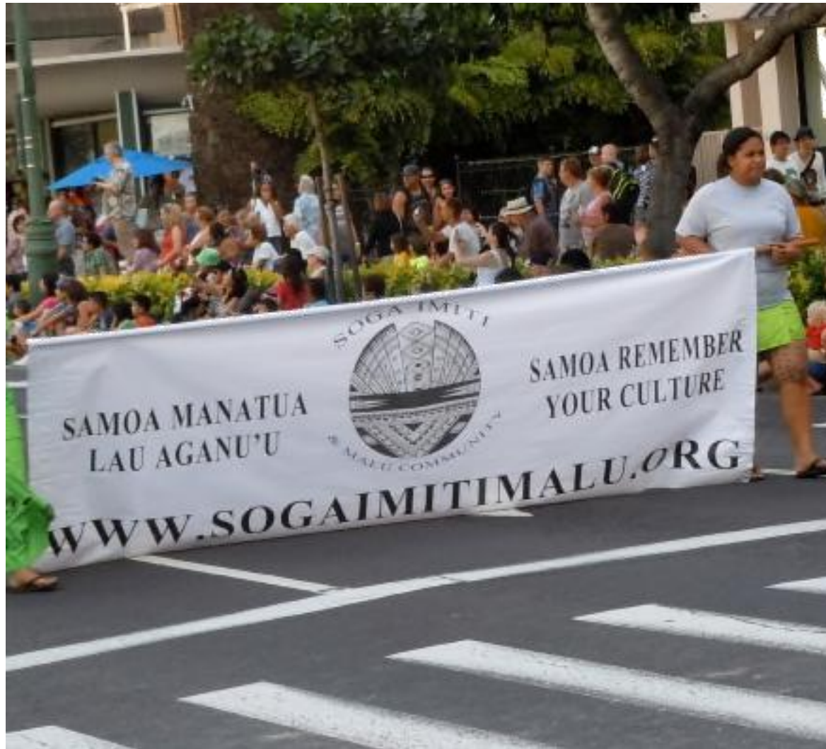
Figure 2.1 Remember "YOUR" Culture – Parade banner.