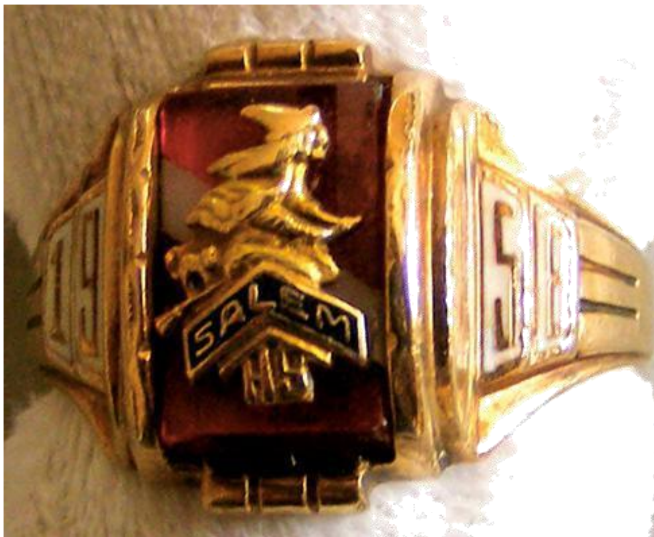
Figure 2.3 Class Ring – Meaningful icon.