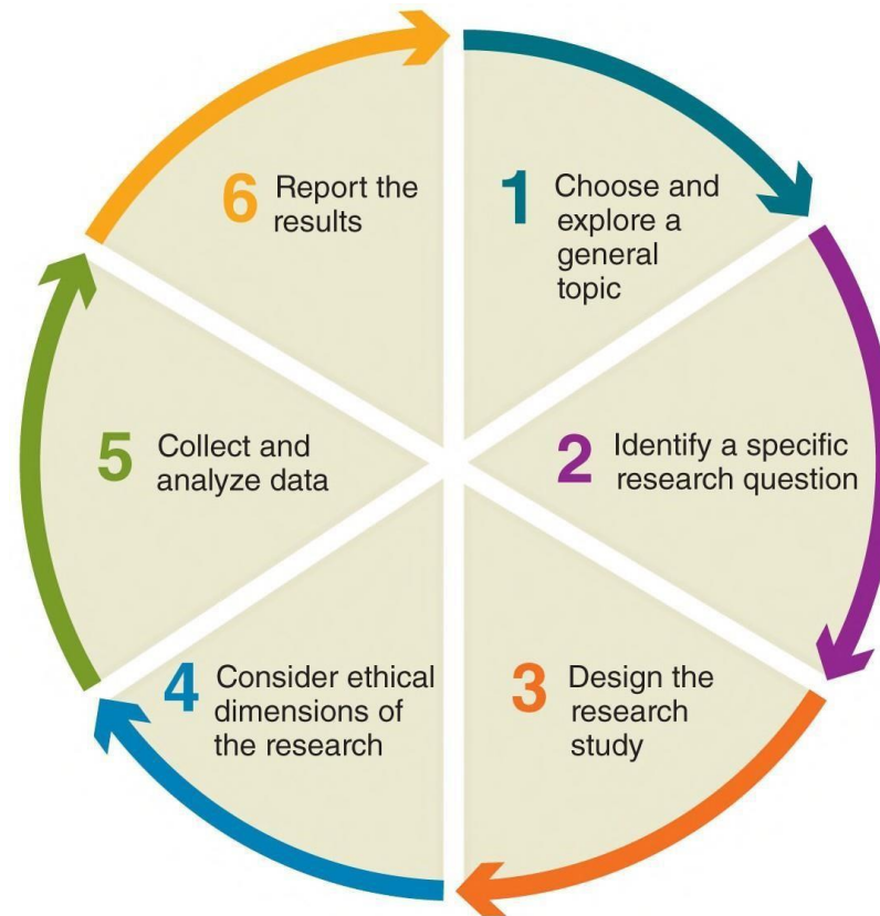
FIGURE 2.2 THE RESEARCH PROCESS

The research process can be thought of as a cycle because existing research is part of the scholarly literature that researchers consult when they develop and design a new study. When findings from a new study are published, they become part of the research literature that future scholars will review as they develop their own research projects.