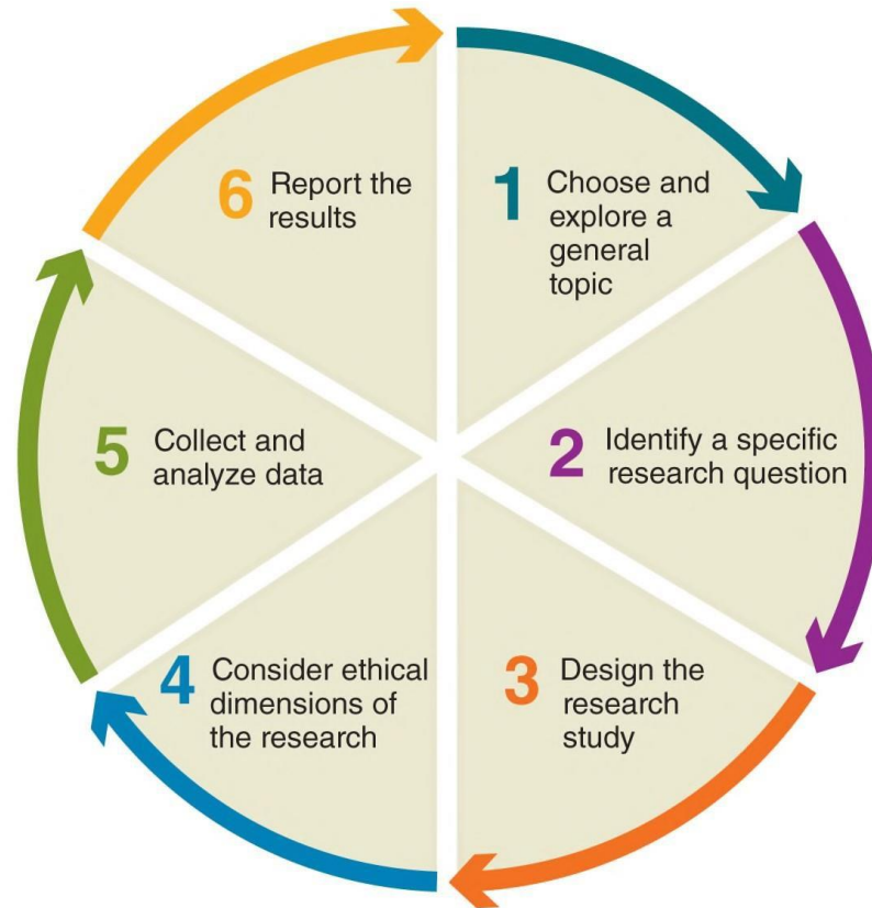
FIGURE 2.2 THE RESEARCH PROCESS

The research process can be thought of as a cycle because existing research is part of the scholarly literature that researchers consult when they develop and design a new study. When findings from a new study are published, they become part of the research literature that future scholars will review as they develop their own research projects.