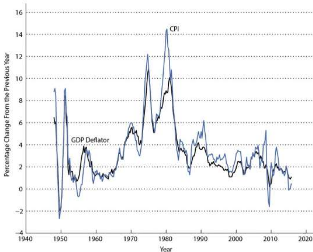
Figure 2.2 Inflation Rate Calculated from the CPI and from the Implicit GDP Price Deflator