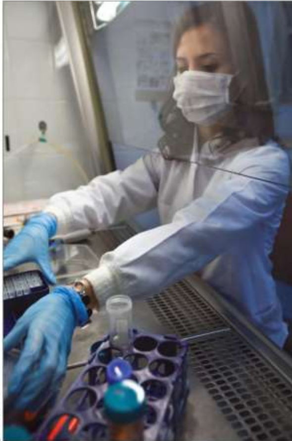
WHMIS legislation, which focuses on chemicals in the workplace, enacts workers' right to know about the hazards in their workplace.