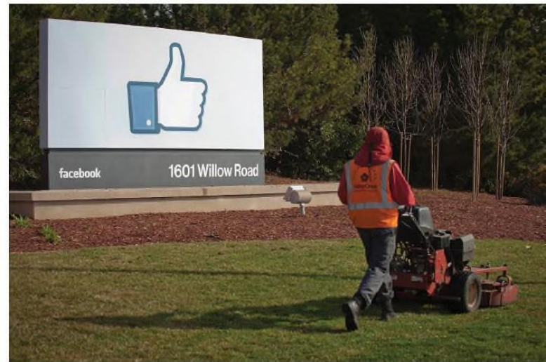
Copyright © 2017 Pearson Education, Inc.

Should a public relations client always be notified?