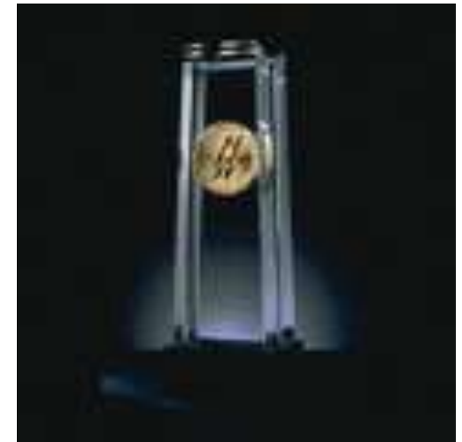
Baldrige Award trophy