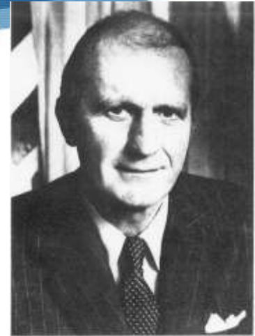
Malcolm Baldrige 1922-1987

Malcolm Baldrige, former U.S. Secretary of Commerce